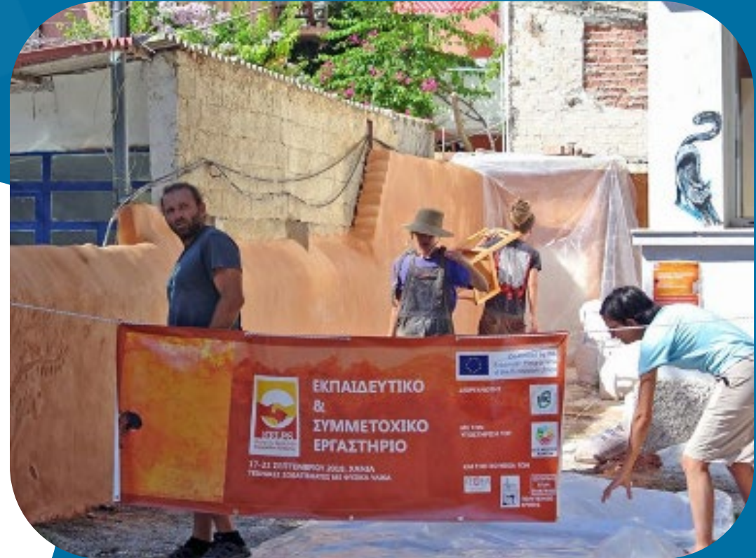
© Les 7 Vents/Hands for Homes in the context of the HELPS project